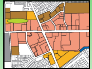
Draft Land Use Plan Moving Forward